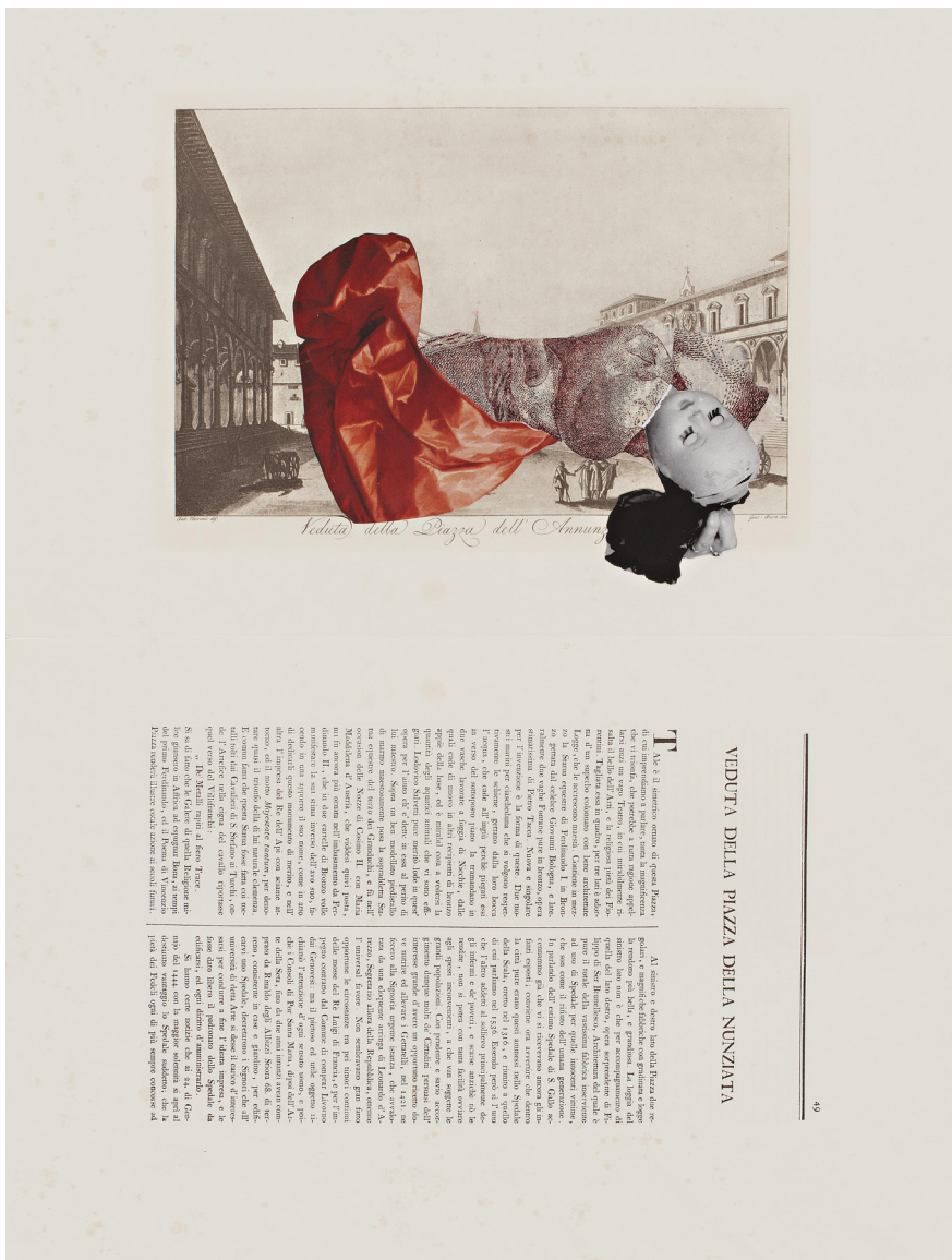
La Figura nella Veduta #2. © Sophia Xeros-Constantinides

‘In this series ‘La Figura nell a Veduta’, I have extended my visual exploration of the world around me with an intergenerational and cross-cultural collage ‘play’. The series was conceived in 2011, whilst on a trip to Italy with fellow artists where I happened upon a second-hand set of reproduction prints depicting antique views of Tuscany, Viaggio Pittorico della Toscana (‘Pictorial Journey of Tuscany’). The reproduction bi-fold pages were exquisite in their detail, encased in battered cardboard bindings, and blemished with age. It felt like I had uncovered a treasure trove buried in time.